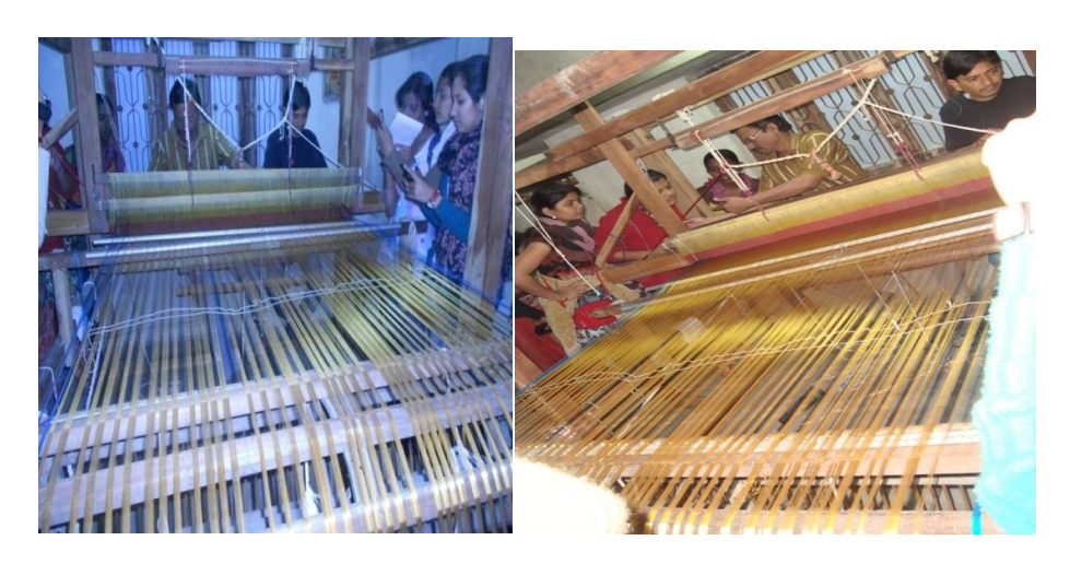
Student's visit at weaving center