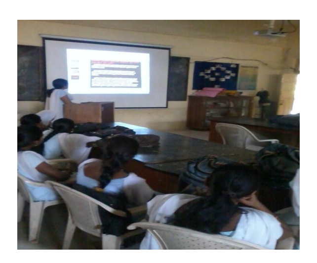
Students engaged in Seminar ( Power Point Presentation)