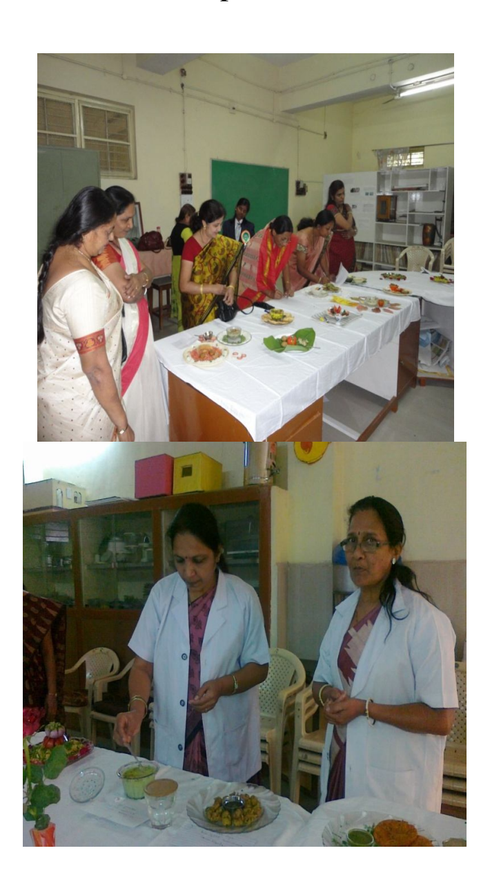
Competitions held in Nutrition week