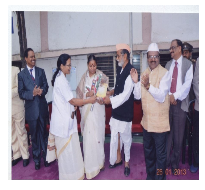
Best non teaching award-2012 bagged by Department