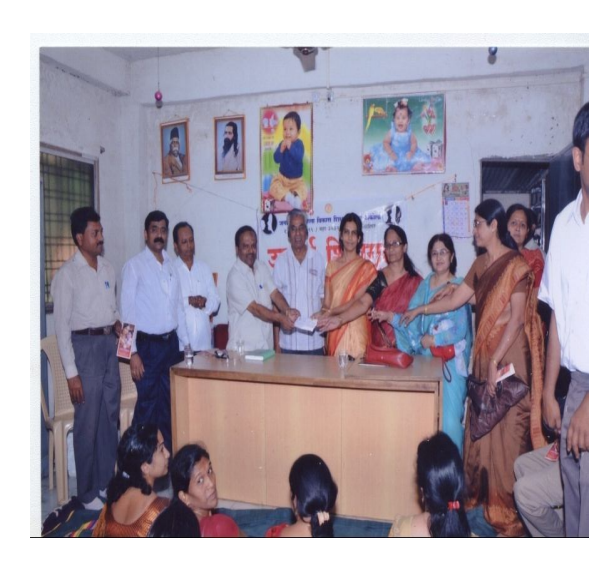
Donation given to Utkarsha shishu gruh-Malkapur