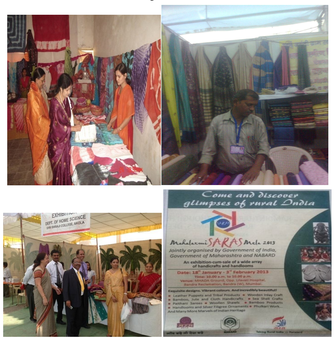
Exhibition & Display of the work by WAWE(an NGO for women employment)