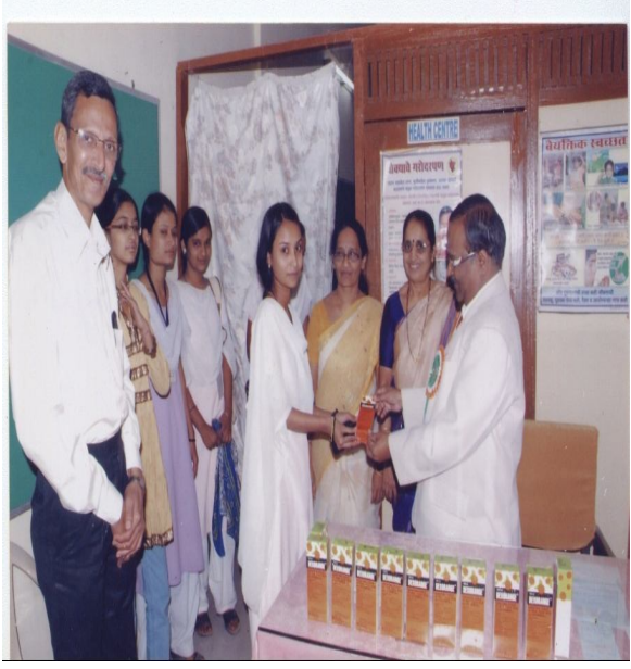
Health & Nutritional guidance to patients at Government Hospital