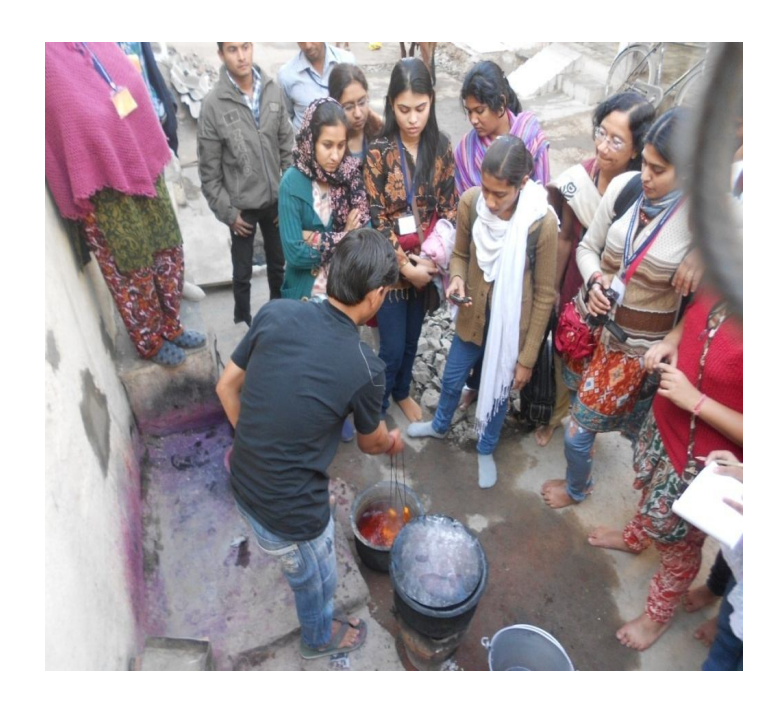
Workshop on Dyeing and Printing